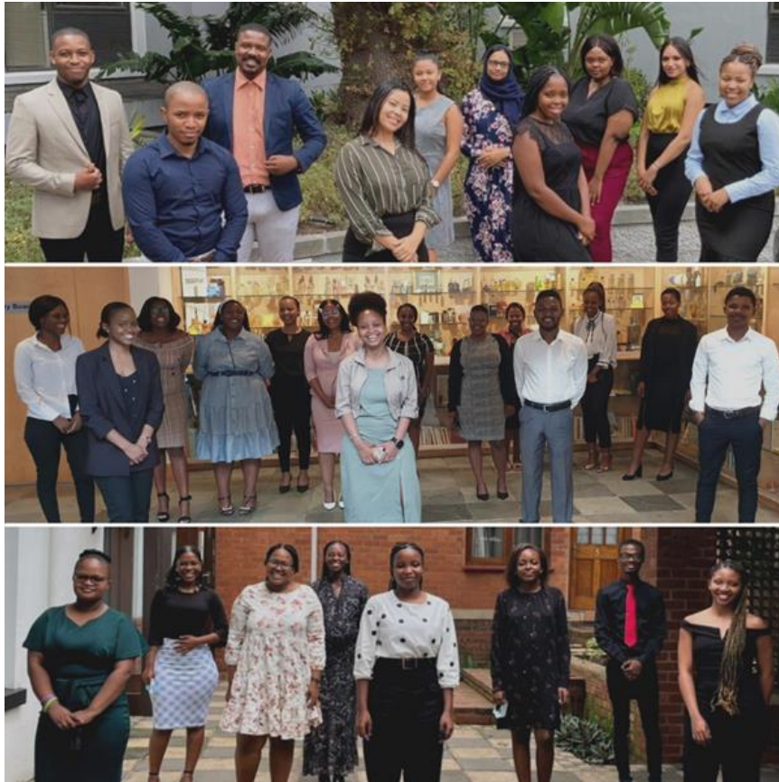
2022 IFA interns who attended the work readiness courses presented in Cape Town (top), Johannesburg (middle) and Durban (bottom). Two interns were absent at the time these photographs were taken.

Launched in 2016 and funded by Allan Gray, Coronation, M & G Investments and Ninety One, the IFA Internship has, to date, created employment opportunities for 215 black graduates interested in pursuing a career in financial planning.